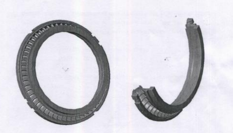
Figure: Stationary Blade Ring Complete and in Half part (Upper Part and Lower Part identical)

"Stationary Blade Ring" for Super-Critical Turbine in completely finish machined condition is required as per drawing and details in the enquiry.